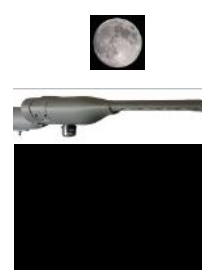
After selected dim off time lamp turns off