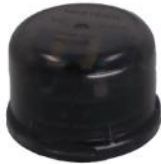
Microwave motion sensor