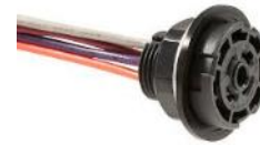
Zhaga Book 18 receptacle