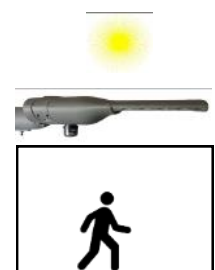
Above daylight threshold lamp off