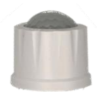
PIR motion sensor