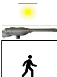
Above daylight threshold lamp off