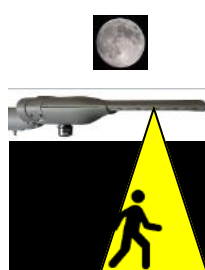
Below daylight threshold lamp on 100% when motion detected